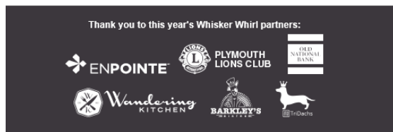
E-mail stationery footer