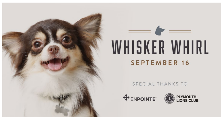
Social media presence