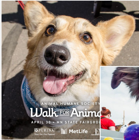
Social media presence