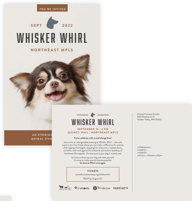
Save the date and invitation postcards